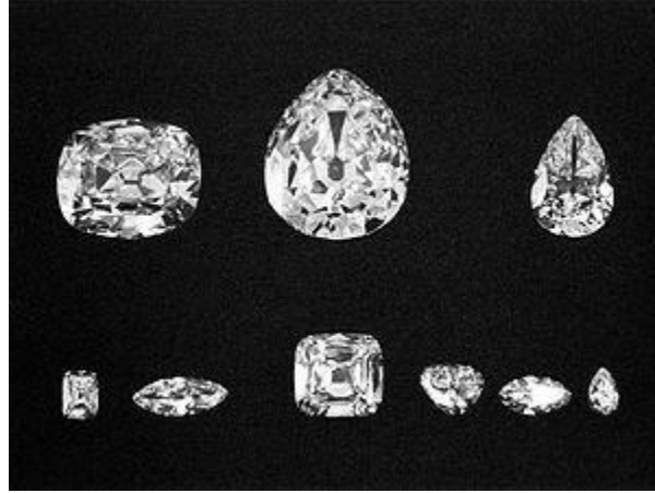
The Nine Major Stones