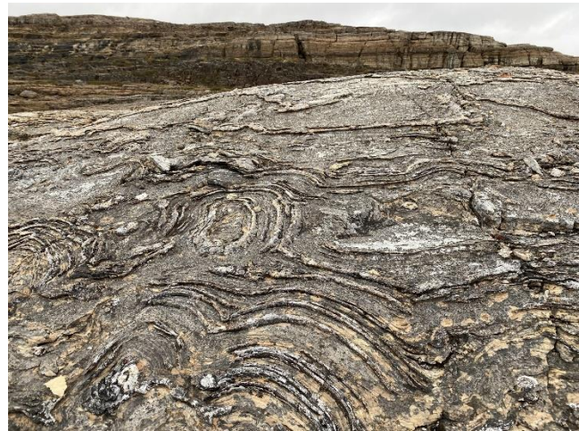
1Ancient Stromatolites Canada

https://explorersweb.com/atacama-lagoons-stromatolites/